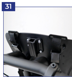
Shoulder strap guide with folding buckles