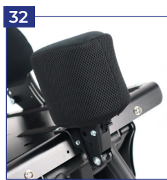
Abduction block swing away and detachable