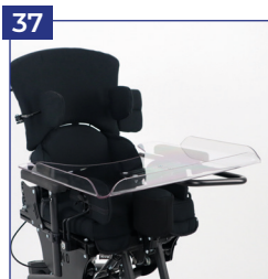
Therapy table, transparent