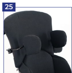
MDP trunk support, swing away