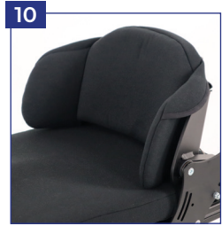
Cushion for back base with adjustable hip pads