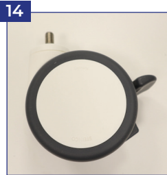
Double castors 100 mm