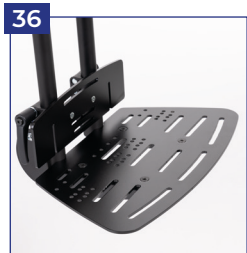
Heel plate aluminium