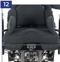
Contoured seat cushion