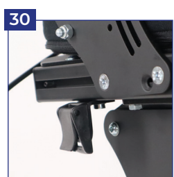
Belt guide with folding buckles