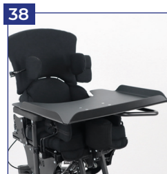
Therapy table, anthracite