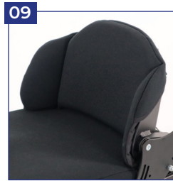
Cushion for back base