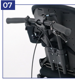
Push handle standard