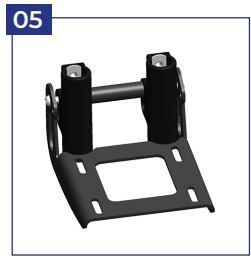
Foot rest bracket, flip up type