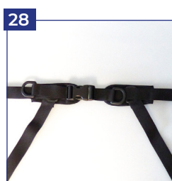
4-point lap belt