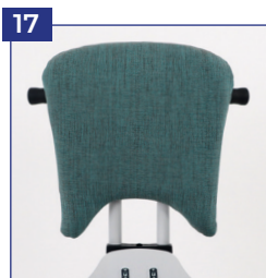
Attachment back long