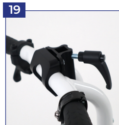
Universal headrest bracket asym.