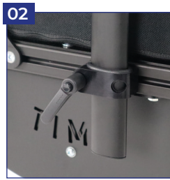
Clamping lever for height adjustment armrests