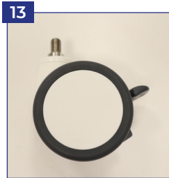
Double castors 75 mm