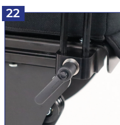
Clamping lever for adjustment thigh supports