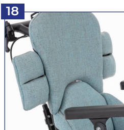
Upper arm guide