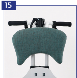
Attachment back short