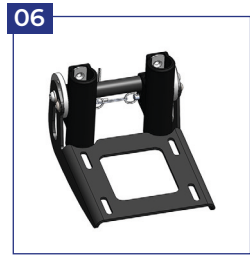
Foot rest bracket, with interlocking