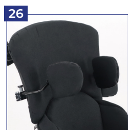
MDP trunk support, standard