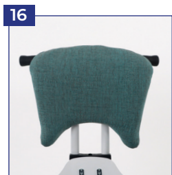
Back top medium