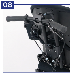
Removable push handle