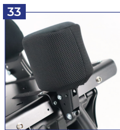
Abduction block fixed