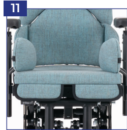
Seat cushion standard