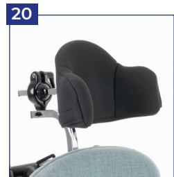
Head rest with mounting bracket